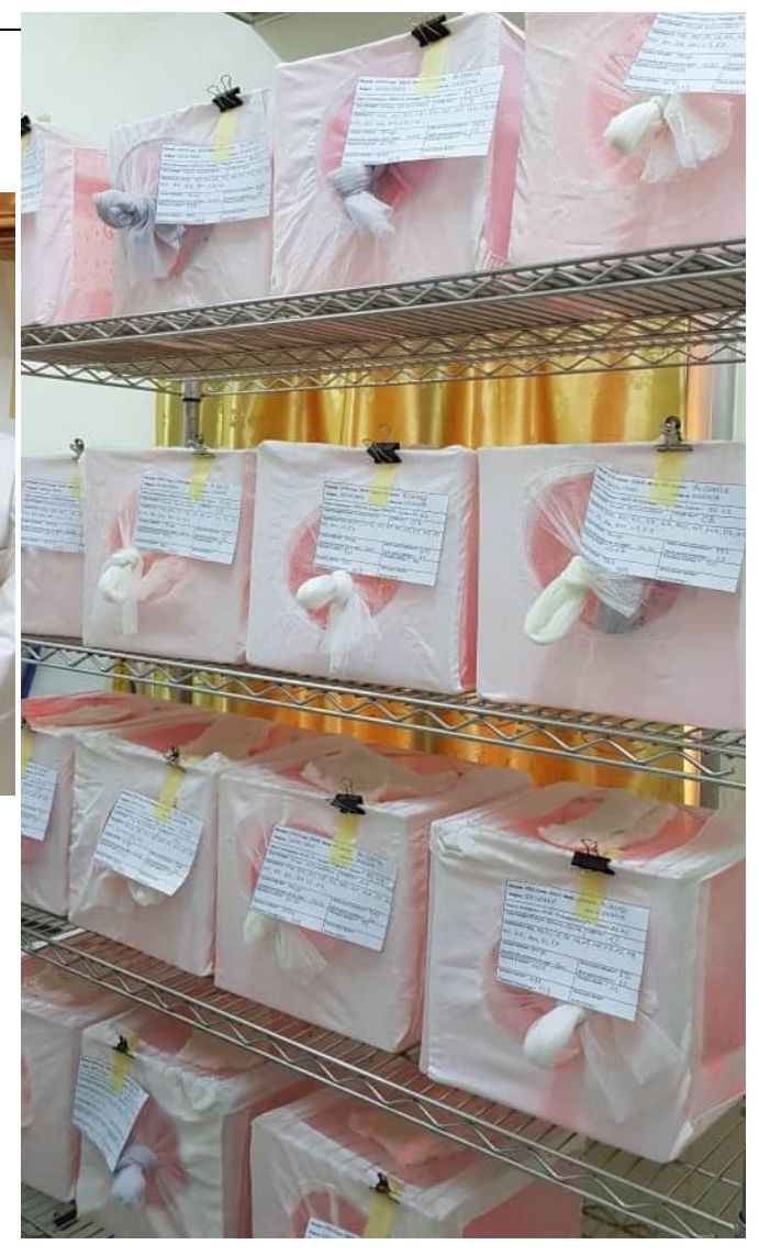
July 1st, 2019